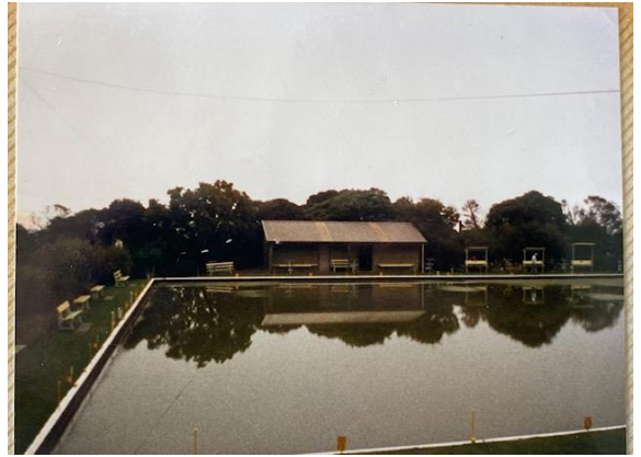
The Great Flood of 1988

1964. The notation in the archives describes these bowlers as "Associates." Was that the term for lady bowlers back then?